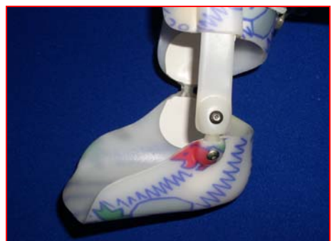
Inset Photo The telescoping lateral member of the ankle joint insures proper contact of the foot to the walking surface during dynamic correction of the tibial section

The JMMR Blounts KAFO is patented and available only through JMMR Inc. The orthosis is central fabricated from your cast and measurements. The turn around time is usually 10-14 days. We recommend you cast your patient with M-Pact OCL Flex Cast Tape (0292f (2'') or 0293f (3'')). This is a flexible fiberglass wrap that is removed with a sharp serrated scissor. This material cures fast and has an excellent memory. Mark all boney areas, indicate knee center, fibula head, medial and lateral malleolus and navicular. Do not leave the stockinet in the cast